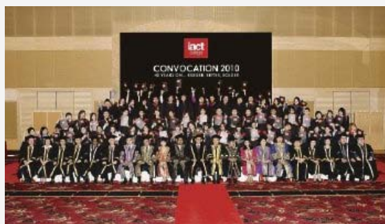
IACT's convocation ceremony held at the Topaz Ballroom, One World Hotel recently.

PETALING JAYA: The IACT Convocation 2010 ceremony was held at the Topaz Ballroom, One World Hotel, for 86 graduates recently.